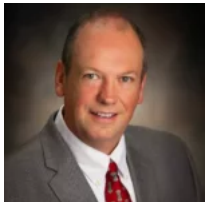
Adashun Jones, Inc.

Here your chance to build your dream home on this wooded corner lot in a great subdivision. Located within walking distance to White Lake Country Club and White Lake Beach