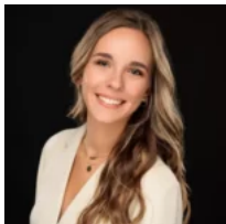
Adashun Jones, Inc.