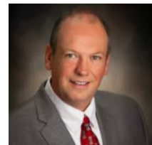
Scott Adashun Jones, Inc.

Here your chance to build your dream home, overlooking the 13th green of White Lake Country Club. Located within walking distance to White Lake Country Club and White Lake Beach.