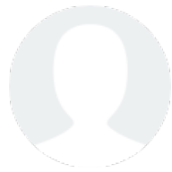
Janice Copperleaf, LLC