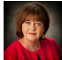
Vickie Adashun Jones, Inc.