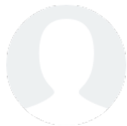
Joy Shorewest, Realtors