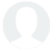
Ryan Corbett Realty