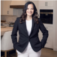
Sarah Adashun Jones, Inc.