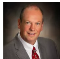
Scott Adashun Jones, Inc.