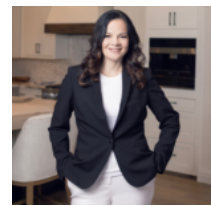
Sarah Adashun Jones, Inc.