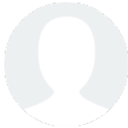
Bill Knaack Realty LLC